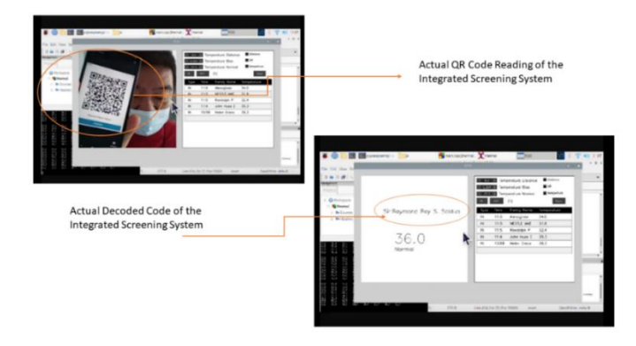
Figure 3. The screenshot of the actual QR code scanning of the Integrated Screening System

Table 2 illustrated the checklist analysis [12][13] of the accuracy of the actual QR code scanning of the Integrated Screening System. The data revealed that the system generated accurate results after eleven (11) precise QR code readings [14], which implied that the ISS is accurate. The study supported a screenshot of the actual reading of the ISS for the study, see figure 3.